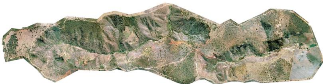
PNHR Bulcão Farm – 2000

The change in the landscape of PNHR Bulcão Farm leaves no doubt. You can restore the Atlantic Forest!