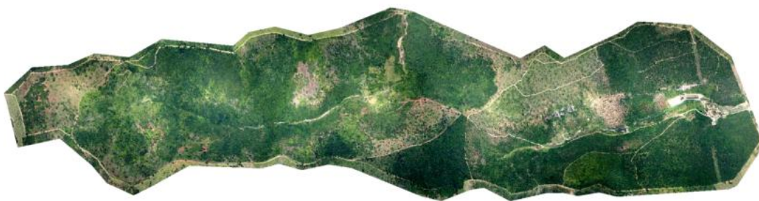
PNHR Bulcão Farm – 2006