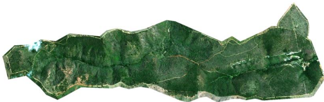
PNHR Bulcão Farm – 2012